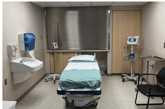
Right Picture: Door is brought down to conceal equipment. All other items in the room can be removed.