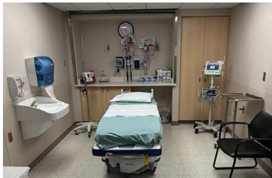
Left Picture: Medical equipment on the wall is exposed providing a threat to the patient and staff.

In addition to school-based services, Pana Community Hospital has enhanced its capacity to care for patients experiencing behavioral health crises within the Emergency Department through the addition of a dedicated mental health room. This space features safety-focused design elements, including secured doors and removable equipment, to better protect both patients and staff while ensuring a supportive environment for care during acute mental health episodes.