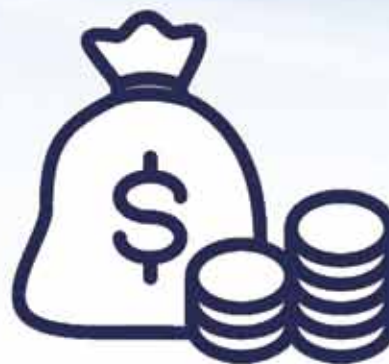
Total Gross Employee Wages