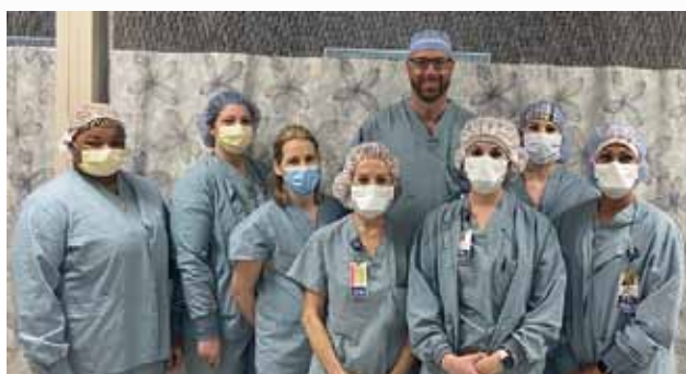
A photo of the surgical team immediately following the first total hip replacement at PCH.