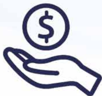
Financial Assistance for those unable to pay