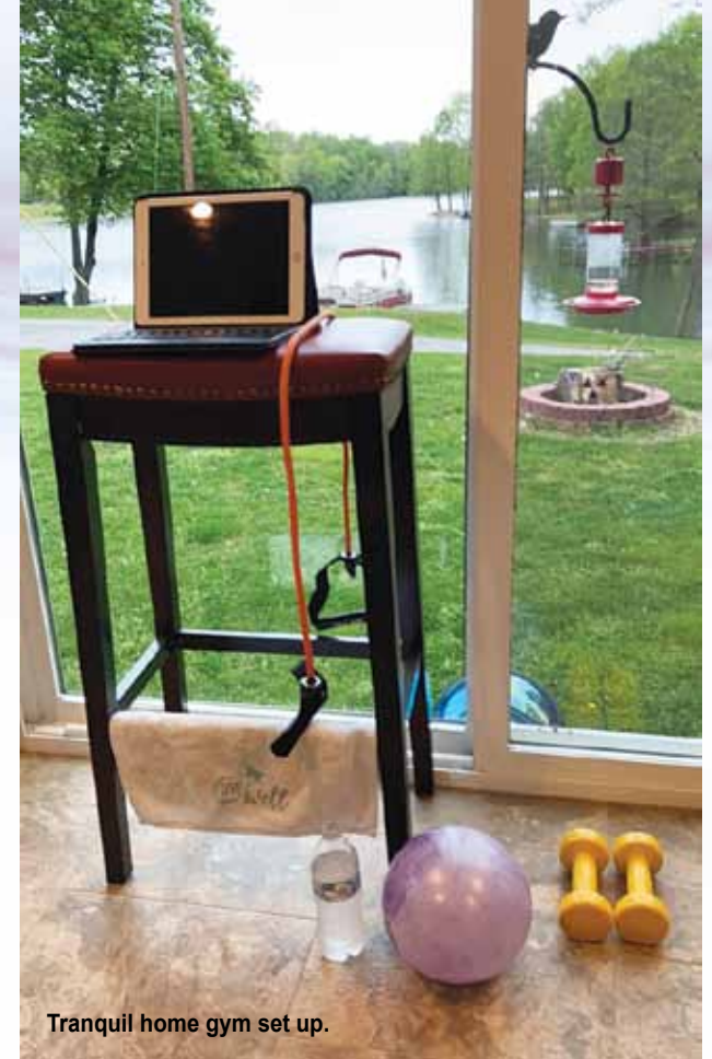
Tranquil home gym set up.