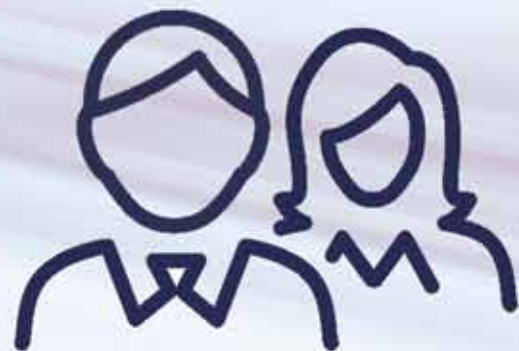
Number of Employees